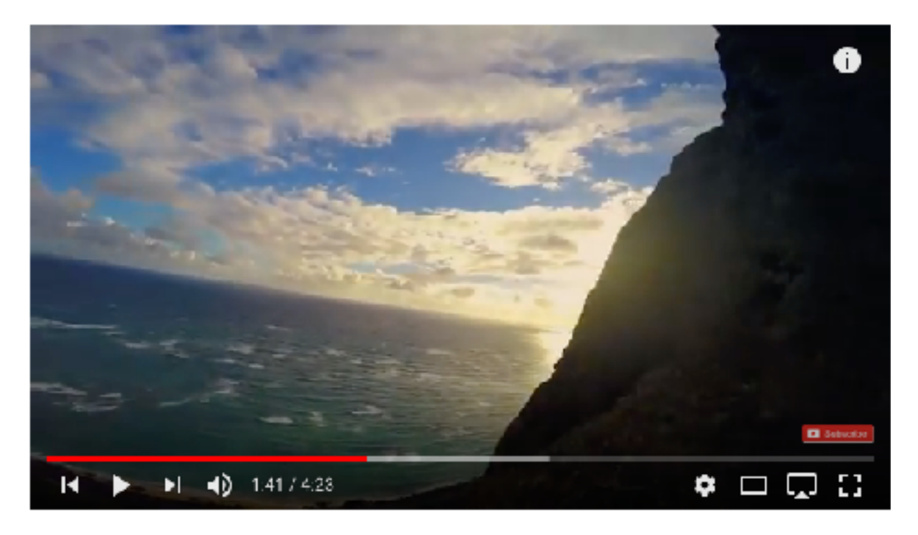
FPV Paradise Hawaii | Nowak FinalGlideAUS | Cliff Diving | Drone Racing